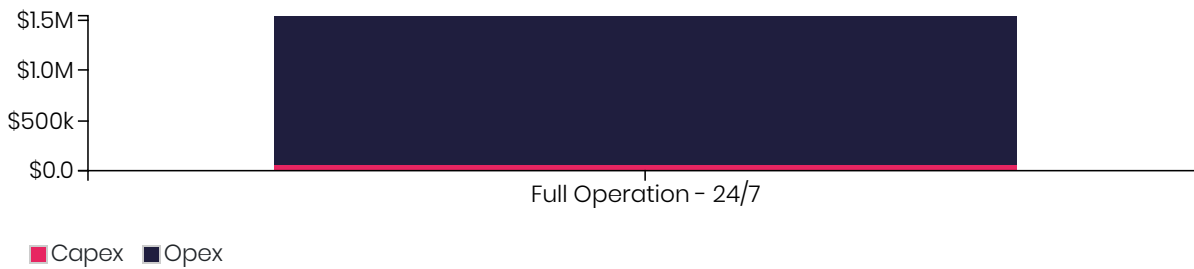
Life Cycle Costs Comparison (NPV)